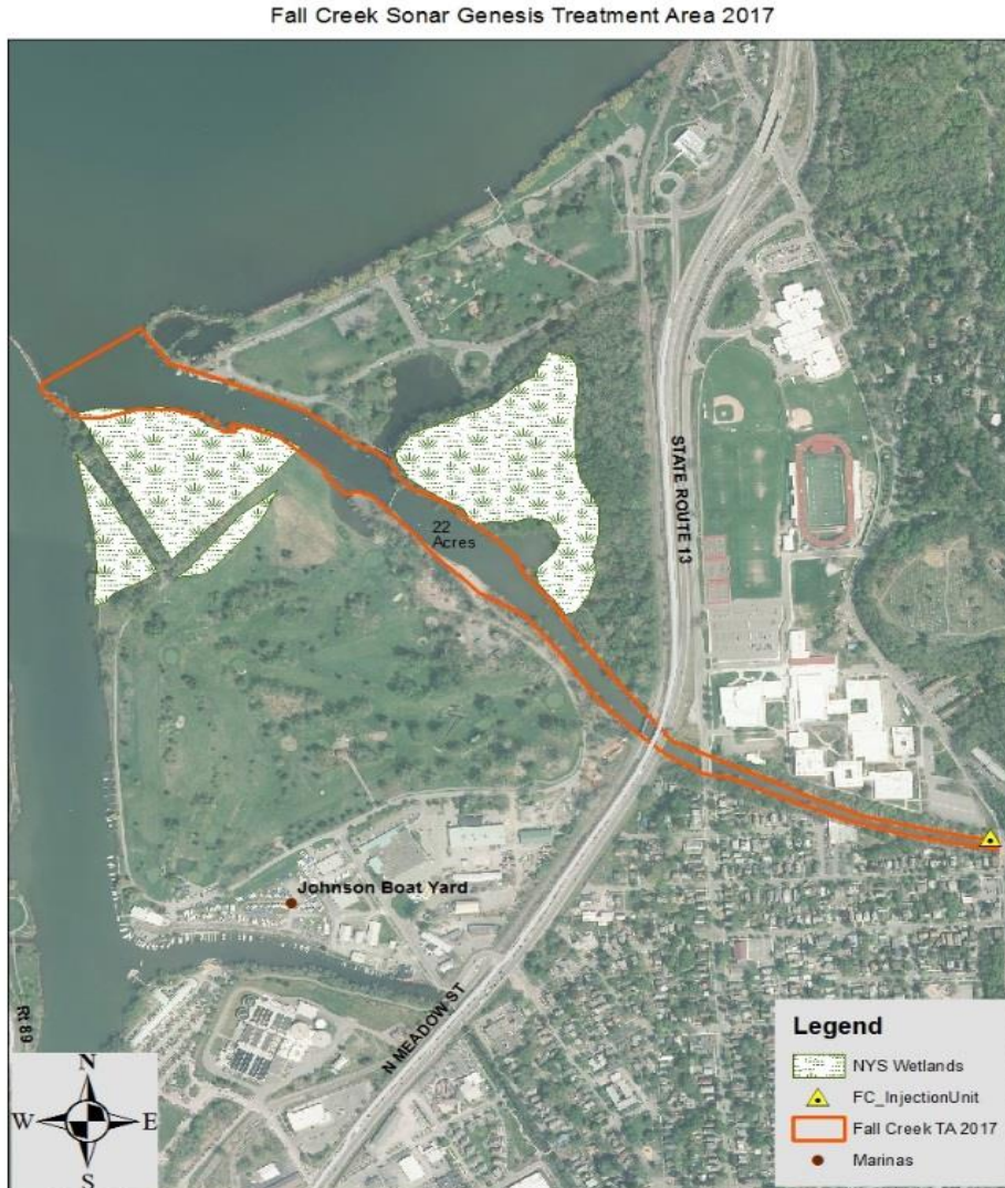
Figure 1: Fall Creek Treatment Area 2017: Sonar Genesis

Primary treatment will consist of a low-dose sub-surface injection of the herbicide Sonar Genesis (active ingredient: Fluridone) to the main channel of Fall Creek over a 60-90 day period (Figure 1, left). A pump system will be installed at an upstream staging area in Fall Creek. This injection system will meter in the appropriate concentration of the Sonar Genesis product. Additional application of Sonar Genesis (active ingredient: Fluridone) to Fall Creek will be conducted via the pump system equipment to ensure proper treatment coverage and effective concentration of the herbicide. Herbicide applicators and representatives from Solitude Lake Management will be on hand to conduct the treatment.