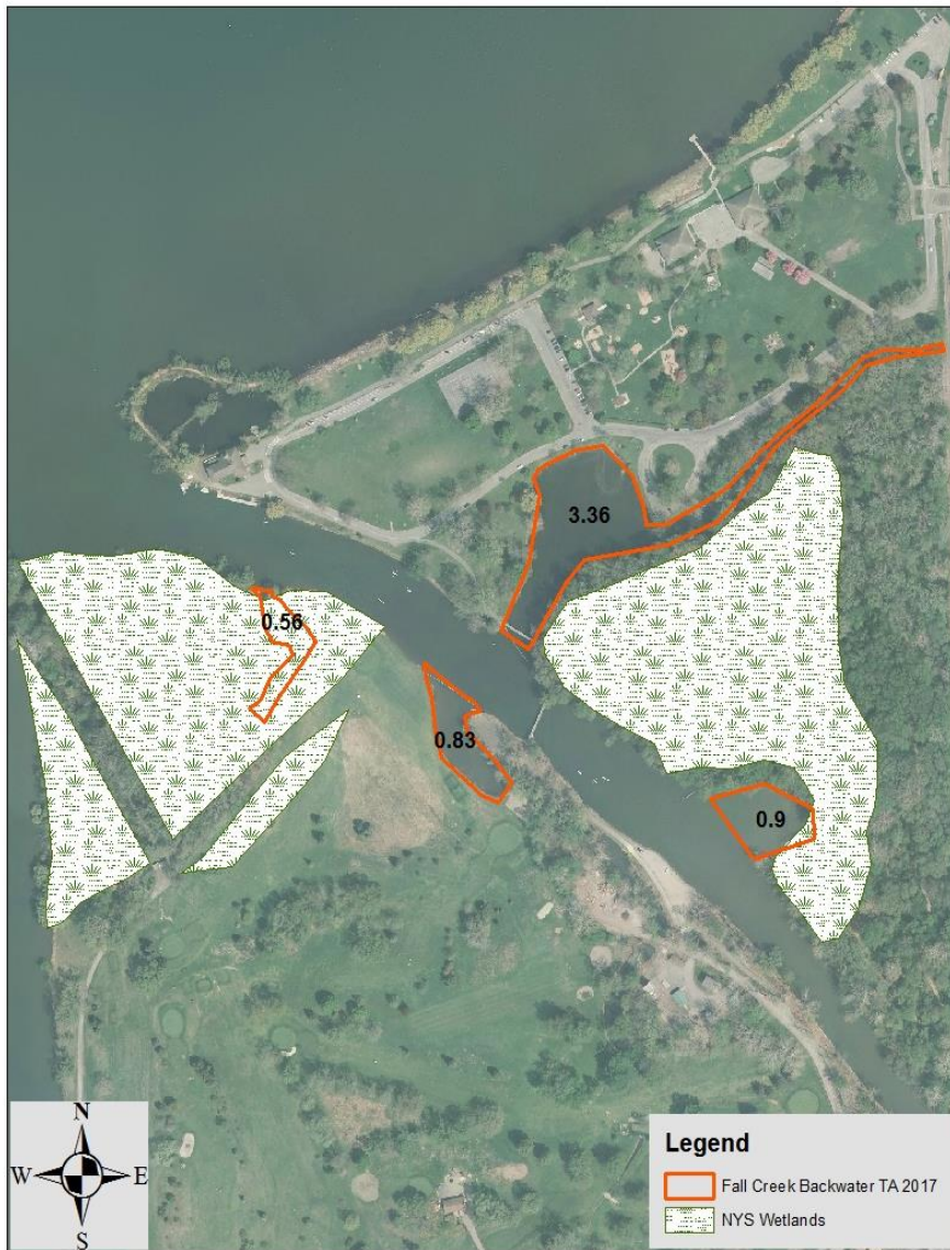
Figure 2: Fall Creek Backwater Treatment Area: Sonar H4C

Following the initial application of Sonar Genesis to address hydrilla biomass in Fall Creek, Sonar H4C (pellets) will be applied to backwater/shallow areas of the Fall Creek system (See Figure 2, left). The goal of the Sonar H4C application will be the prevention of hydrilla growth in backwater/cove areas that will not get treated via Sonar Genesis due to the lack of flow into these areas. Turbidity curtains will be installed along the confluence of the golf course lagoon (0.83 ac) and Stewart Park pond (3.36 ac) to control the concentration of herbicide in these locations.